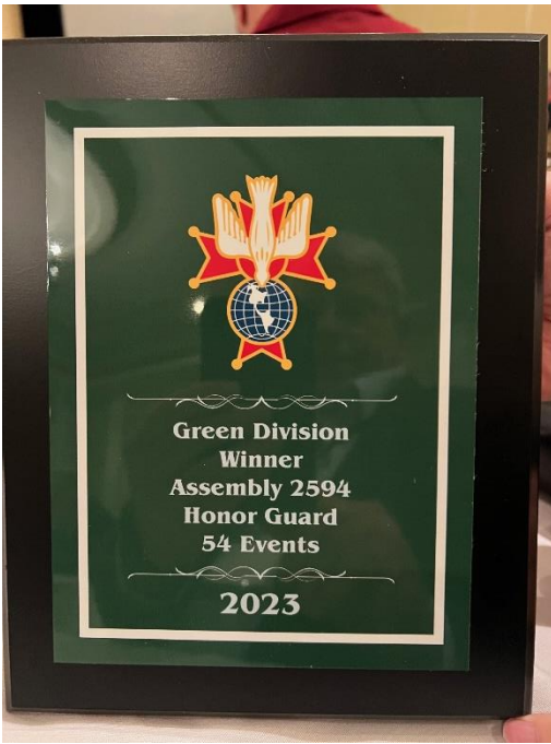
Assembly: Green Division Award: Winner for most honor guard events attended (54)-2023.