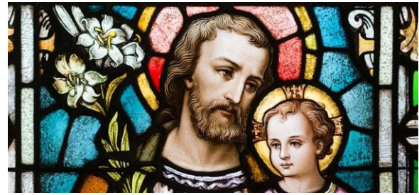
St Joseph the Worker

Editor's Note: This is late because I have had some issues getting names for pictures, and getting all of the photos and other data in the appropriate place. I have already started on the next newsletter to make sure it is published on time.